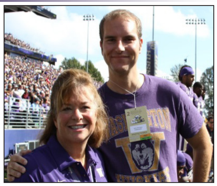
CSG is always ready to help!