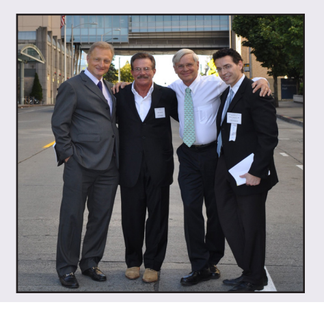
A grateful patient poses with his Orthpaedic surgeons.