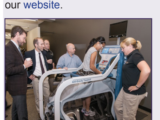
Top of the line physical therapy

For the most up-to-date information on the Sports Medicine Center at Husky Stadium, please go to