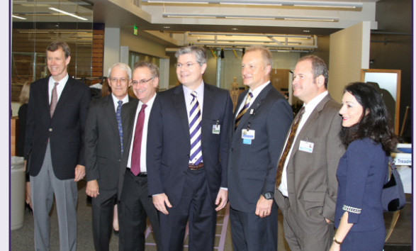
Sports Medicine Center Grand Opening