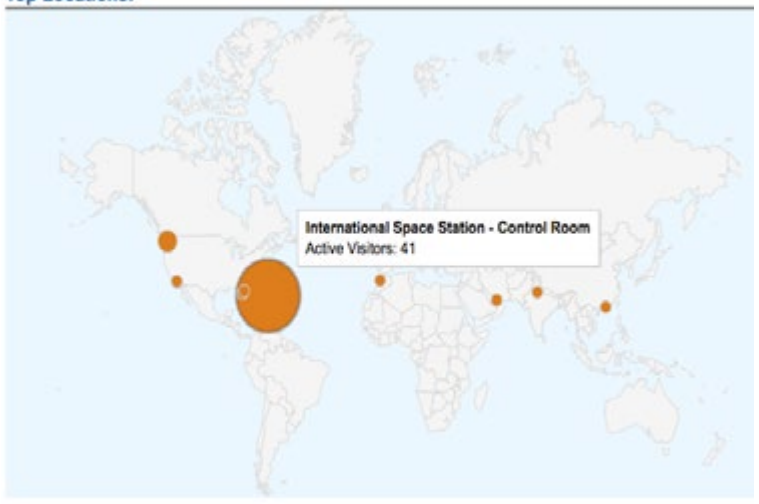
April Fools? According to Google Analytics, on 4/1/13 we had 41 active users on our website from the International Space Station